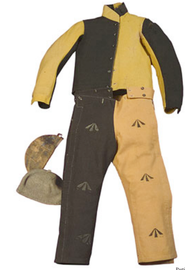
Particoloured convict uniform National Library of Australia

Convict uniforms were stamped or stencilled with the broad arrow mark, a symbol dating back to the 17th century that featured on all British Government property. A black arrow was marked on light fabrics and a white or yellow arrow marked on dark fabrics. Because of their poor quality, few of these uniforms have survived. Fremantle Prison has three jackets (two particoloured and one plain), one flannel short sleeved shirt and the remnants of a belt in its collection.