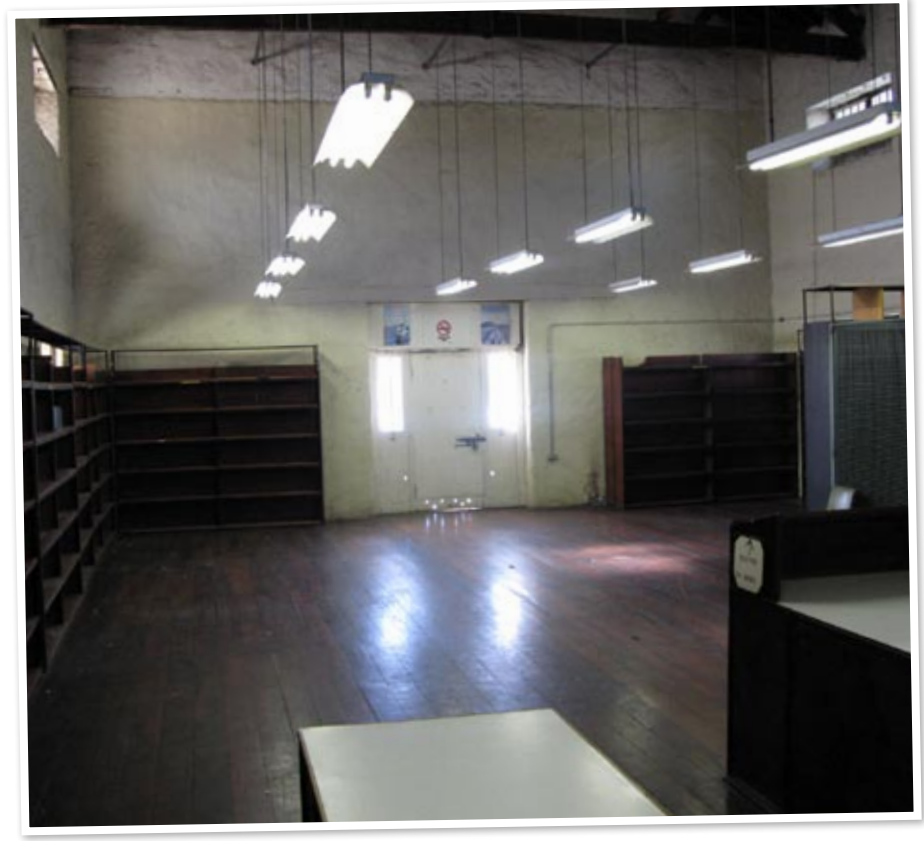
Fremantle Prison library, originally the southern upper Association Ward 2009

Convicts slept in hammocks that were folded away each morning. Each ward had a large wooden tub that served as a communal toilet. The convicts had to carefully carry these tubs outside daily to be emptied and cleaned. Each of the wards held up to 60 men.