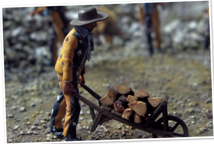
Detail of a diorama showing the convict uniform