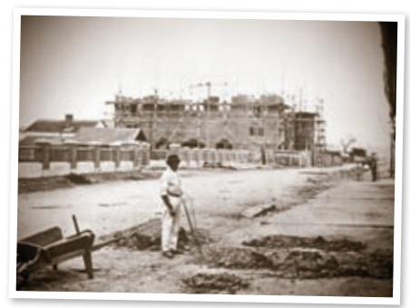
Convict working on road during construction of the Perth Town Hall c1868

The Perth Town Hall is the only convictbuilt town hall in Australia. The tower is 120 feet high and decorated with a number of convict motifs, including windows in the shape of the broad arrow and decorations in the shape of a hangman's rope.