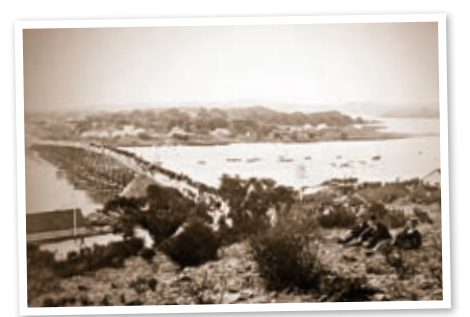
The North Fremantle Bridge c1870s

The bridge itself was 954 feet long and 2078 feet with the approaches.<sup>6</sup> At the midpoint it was 42 feet above the water to allow for the passage of boats. On its completion the Clerk of Works, James Manning, arranged for the convicts who had worked on the bridge be given extra rations in appreciation for their work. Improvements immediately commenced on the northern road (later to be named Stirling Highway). Convicts used sawn sections of jarrah to strengthen the road's surface which were anecdotally referred to as Hampton's Cheeses.