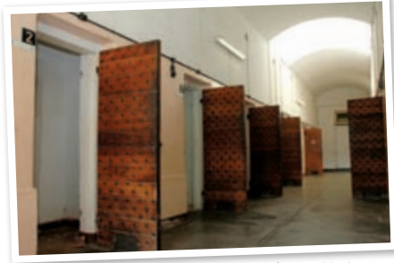
Refractory block 2006 Fremantle Prison Collection

Prisoners who attempted to escape were flogged and locked in solitary confinement on a diet of bread and water. There were 12 punishment cells and six windowless 'dark' cells. Each cell had double chambers with inner and outer doors for added security which also prevented communication between prisoners. The only things the convicts had for company were a toilet bucket, a bed without a mattress, a blanket and a bible.