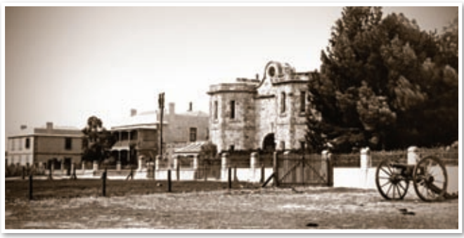
Fremantle Prison Gatehouse with signal cannon in foreground c1870s

During and after a visit to Fremantle Prison students will have an opportunity to evaluate and fine tune their escape plans.