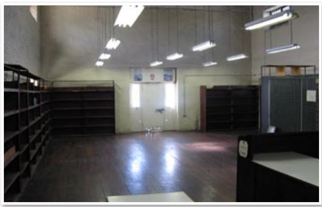
Fremantle Prison Library 2008 Fremantle Prison Collection

If you require use of the Library, inform the Bookings Officer at the time of your booking.