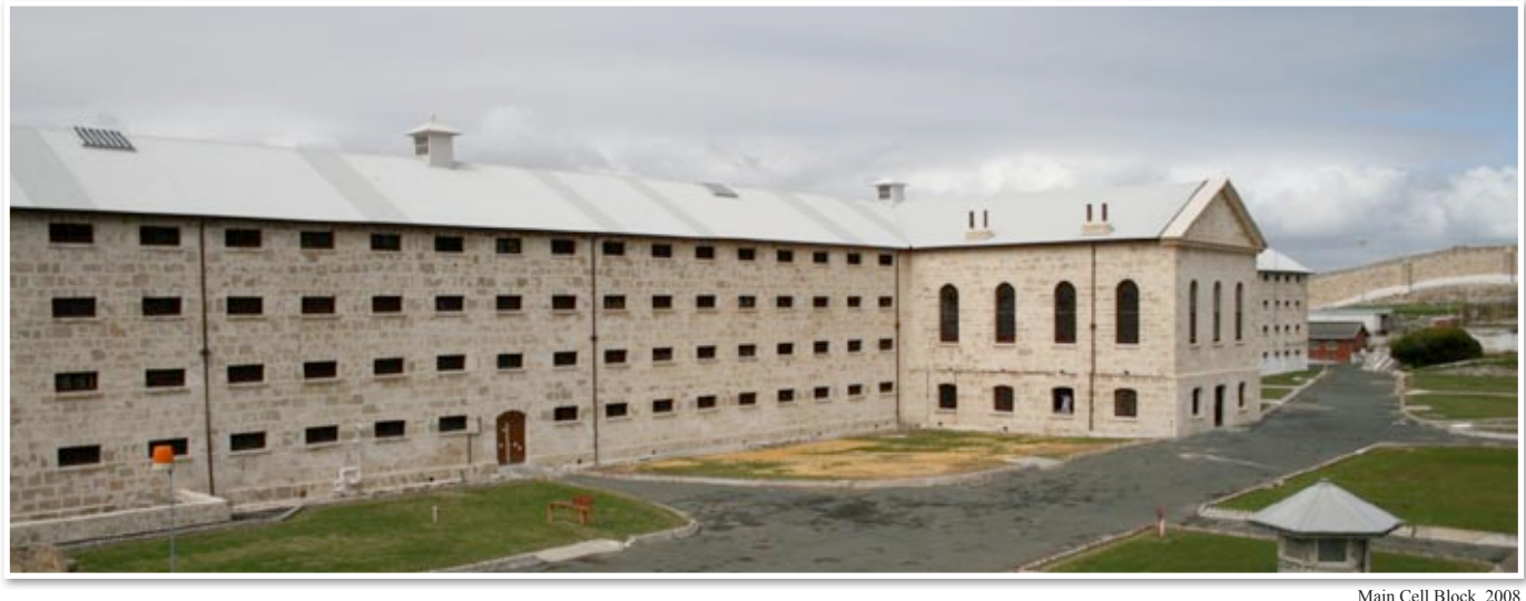
Main Cell Block 2008

The photograph below shows the same view of Fremantle Prison in 2008, 149 years later.