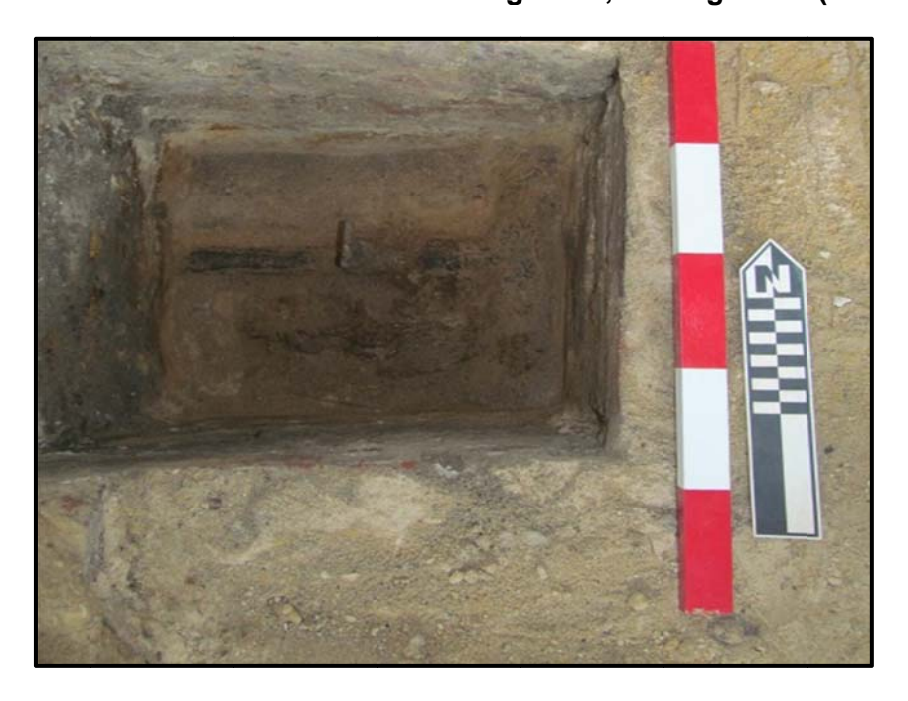
Plate 13: View of brick feature C.37 in Sondage RS3, looking north (Scale = 50 cm)

The chamber was rectangular in plan and measured 0.50 m (E/W) by 0.35 m (N/S) by 0.60m in depth and contained a single fill (C.40) of mottled, loosely compacted brownish grey fine grained silty sand. Natural subsoil (C.80) was revealed at the base of the feature.