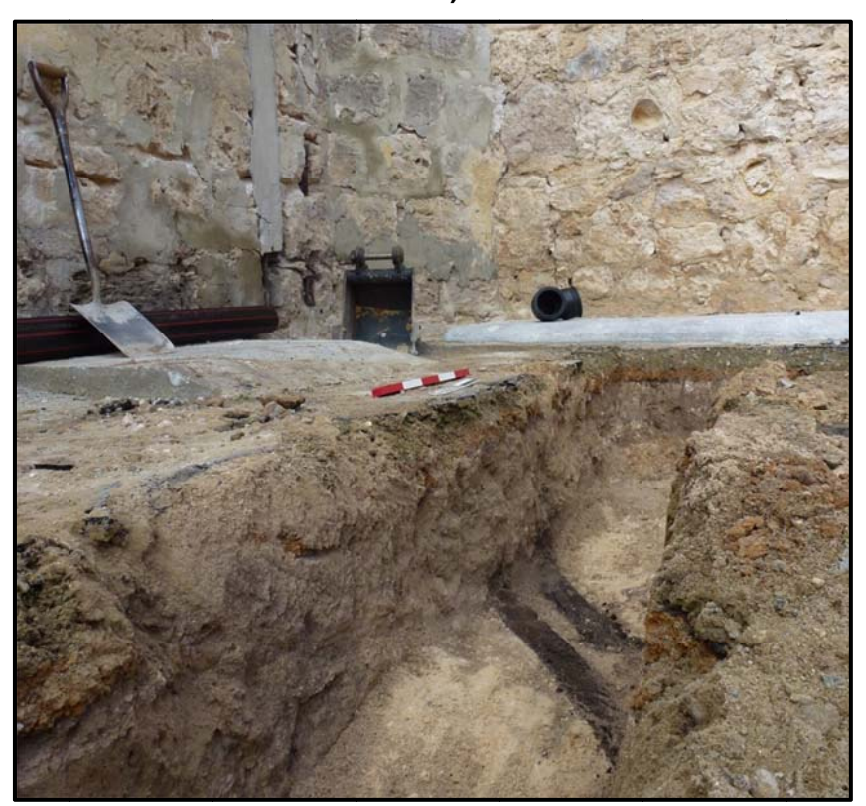
Plate 6: View of electrical feature C.118 in Trench ST6, looking southeast (Scale = 50 cm)

The orientation of the electricity conduit aligns with a corroded iron bracket located on the eastern wall in the southeast corner of the Eastern Courtyard area. A modern floodlight is present above this bracket and it is possible that a previous light (since removed) was once attached to the bracket and connected to the electricity conduit. Furthermore, the electricity conduit is oriented northwest toward a mains board located within the eastern wing of the Female Division building.