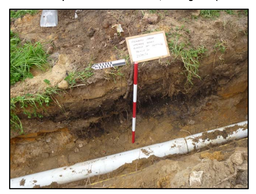
Plate 10: View of pit C.107 in Trench ST20, looking east (Scale = 1 m)