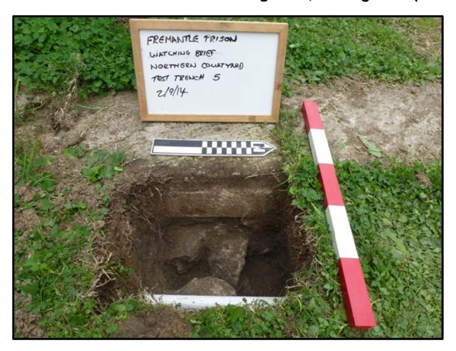
Plate 17: View of wall C.78 revealed in Sondage TS3, looking west (Scale = 50 cm)

The wall represents a distinct split in the subsurface stratigraphy of the Northern Courtyard area as noted in Trenches ST8 and ST21. The wall consists of a single course of roughly hewn cut limestone blocks with average dimensions of 0.50 m by 0.30 m by 0.20 m. The top surface of these blocks was level with the current topsoil layer. The footing of the wall consists of a firmly compacted limestone rubble construct in a light greyish brown lime and sand mortar (C.79) that was partially exposed to a depth of 0.35 m and cut into the natural subsoil (C.80). The overall depth of the wall is 0.55 m and it has a surviving width of 0.30 m and length of 6.75 m, extending from the northern wall of the Female Division to the northern Perimeter Wall.