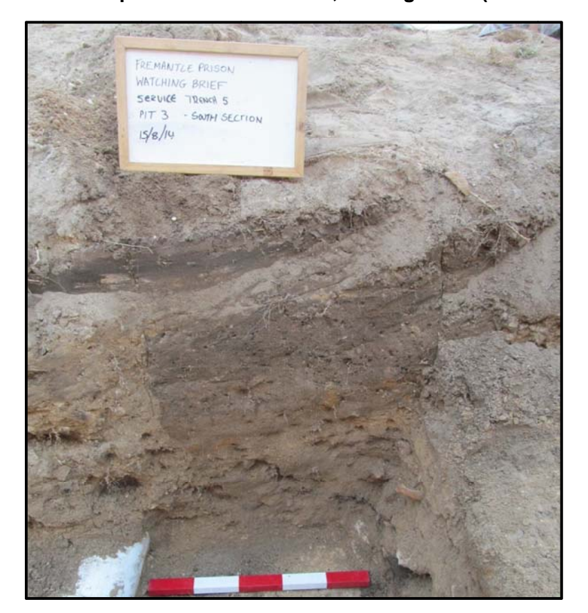
Plate 9: View of pit C.62 in Trench ST5, looking south (Scale = 50 cm)