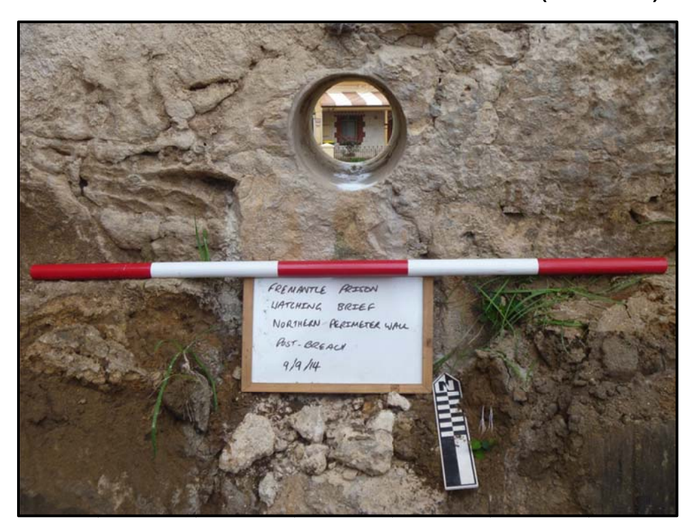
Plate 3: Service duct hole in northern Perimeter Wall (Scale = 1m)