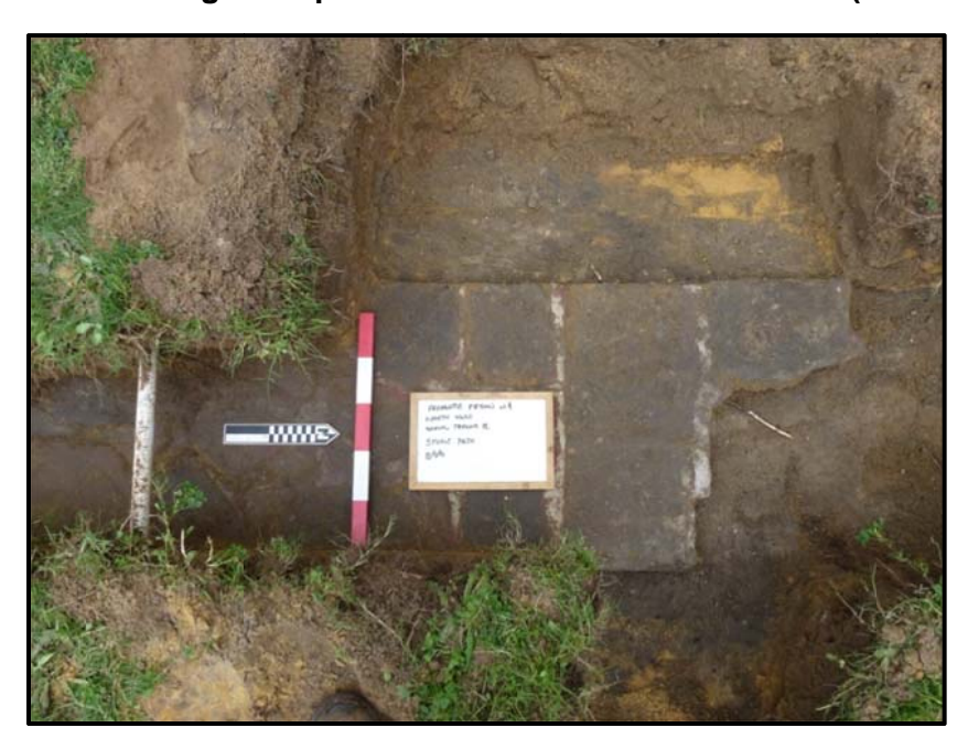
Plate 16: View of flagstone path C.93 revealed in Trench ST12 (Scale = 50 cm)

The path is 0.60 m wide (E-W), with a maximum length of 4.20 m (N-S) and consists of a layer of cut limestone flagstones set in a concrete mortar (see Plate 16). The flagstones have average dimensions of 0.30 m by 0.60 m by 0.07 m.