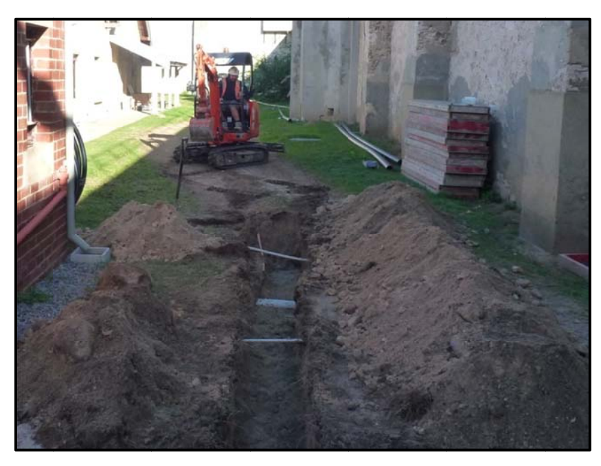
Plate 2: View of trenching works in the Northern Courtyard of the Female Division

Additionally, holes for service ducts were drilled through the basal courses at two locations along the Perimeter Wall. The first was drilled through the northern Perimeter Wall at the northern extent of Trench ST12 (see Plate 3). This purpose of the first service duct was to connect the fire services system with the existing mains supply located on Knutsford Street. The second service duct was drilled through the western Perimeter Wall at the western extent of Trench ST19 (see Plate 4). The purpose of the second service duct was to connect the fire services system to a fire hydrant located on The Terrace.