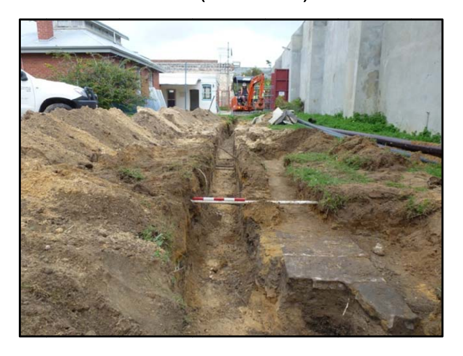
Plate 15: View of realignment of Trench ST12 (note flagstone path C.93), looking south (Scale = 50 cm)

The path is 0.60 m wide (E-W), with a maximum length of 4.20 m (N-S) and consists of a layer of cut limestone flagstones set in a concrete mortar (see Plate 16). The flagstones have average dimensions of 0.30 m by 0.60 m by 0.07 m.