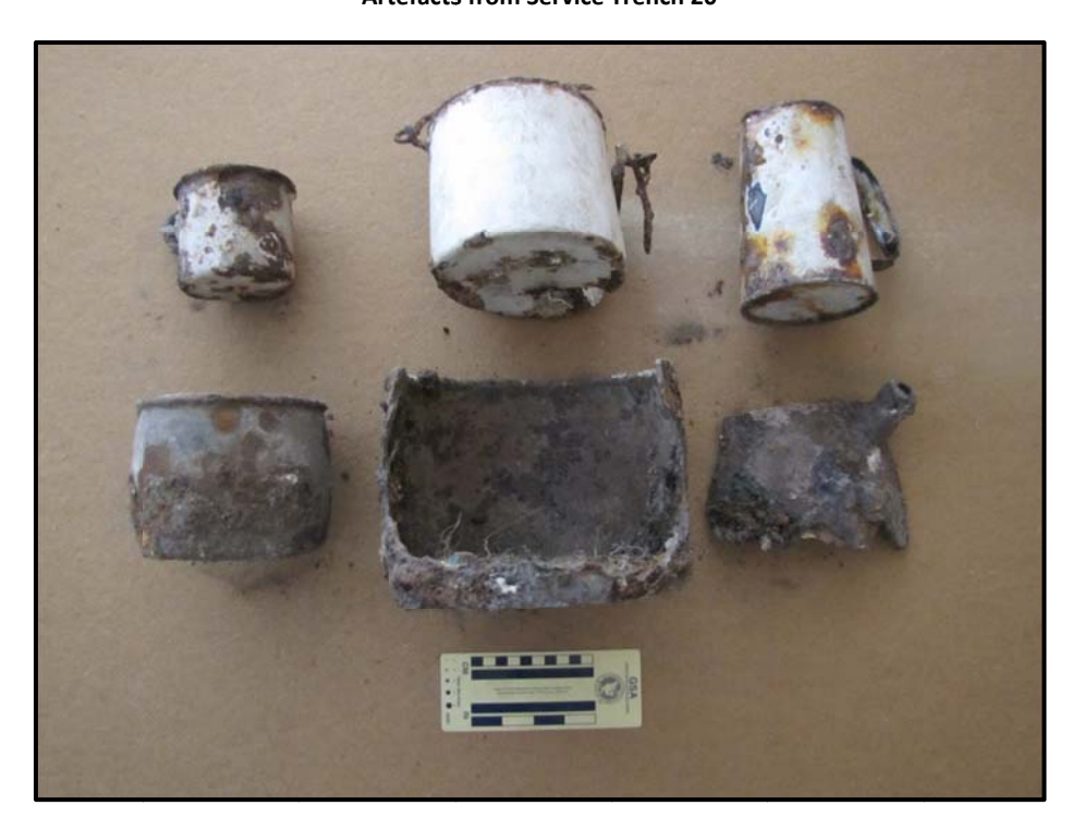
Artefacts from Service Trench 20