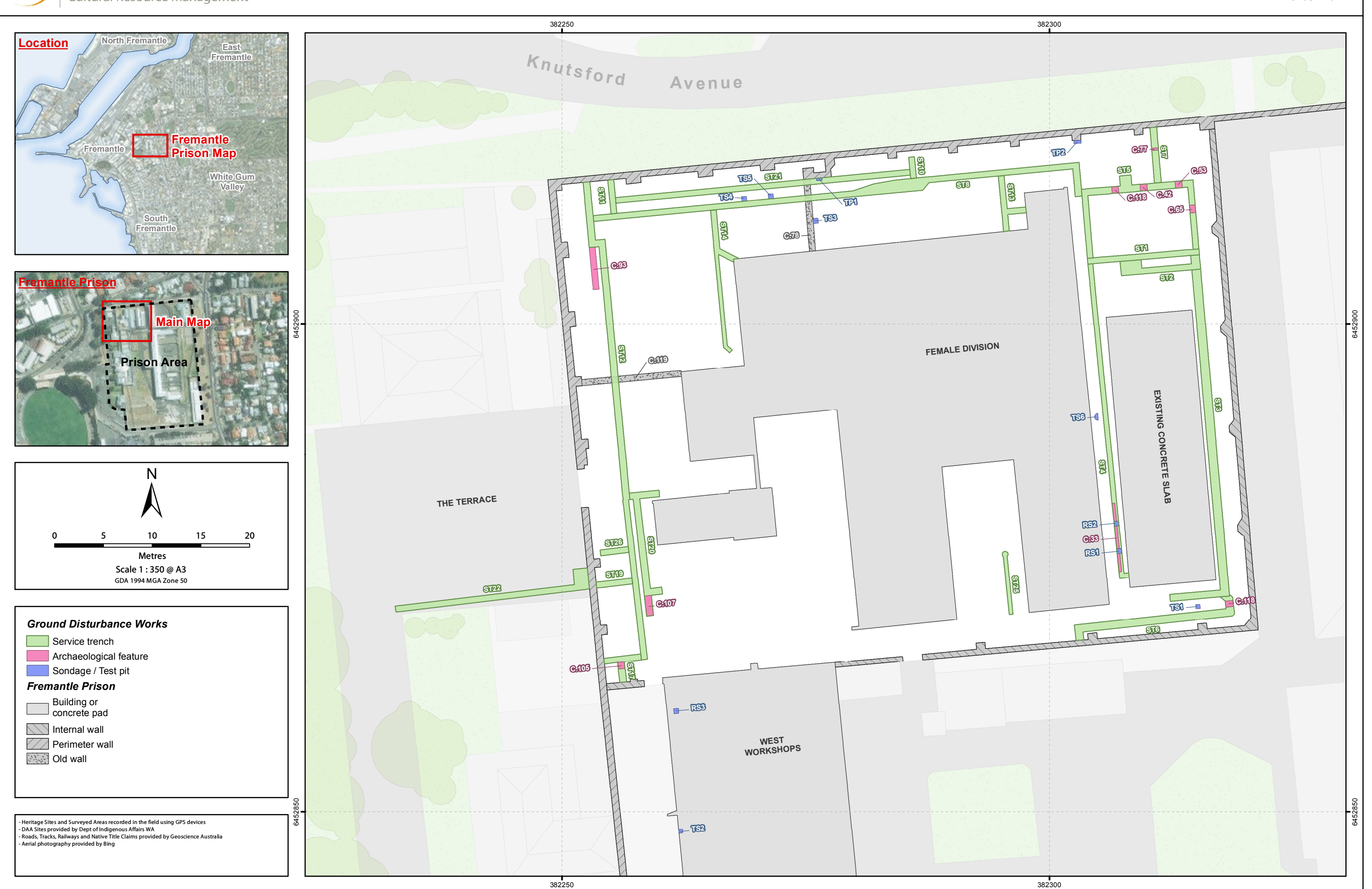
Map 1: Fremantle Prison Watching Brief Site Plan