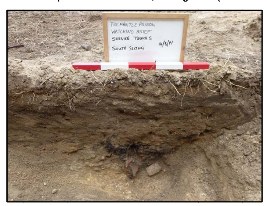
Plate 7: View of pit C.42 in Trench ST5, looking south (Scale = 50 cm)

An occupational debris pit (C.42) was revealed and recorded near the centre of Trench ST5 within the southern baulk (see Figure 1). The pit cuts through the natural subsoil and was sealed by layer C.45 (see Plate 7). The pit was truncated by the trenching works and had a maximum exposed width of 0.40 m (E/W) and depth of 0.17 m. It contained a single fill (C.41) comprised of loosely compacted, dark greyish brown sandy loam with charcoal flecks and chunks. A number of finds were recovered from this context (see Appendix 8). The cut (C.42) was v-shaped in profile with straight sides and a pointed base.