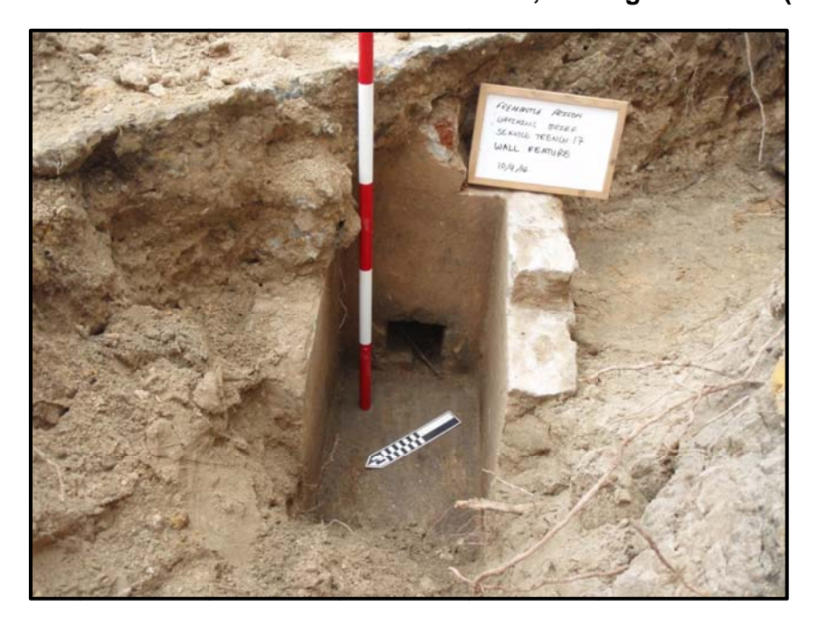
Plate 14: View of brick feature C.105 in Trench ST17, looking southeast (Scale = 1 m)

A rectangular aperture was present near the base of the feature within the back wall, revealing a channel extending southeast for a further 0.70 m. This feature was overlain by a 0.30 m deep layer (C.127) of mottled, moderately compact, yellowish grey fine grained sand and included large sub-rounded limestone and red brick fragments. A layer of poured concrete (C.128), 0.10 m in depth overlay C.127 and this in turn was capped by three large concrete slabs (C.129) which formed the ground surface level at the time of the groundworks.