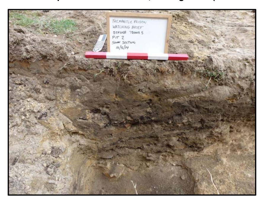
Plate 8: View of pit C.53 in Trench ST5, looking south (Scale = 50 cm)