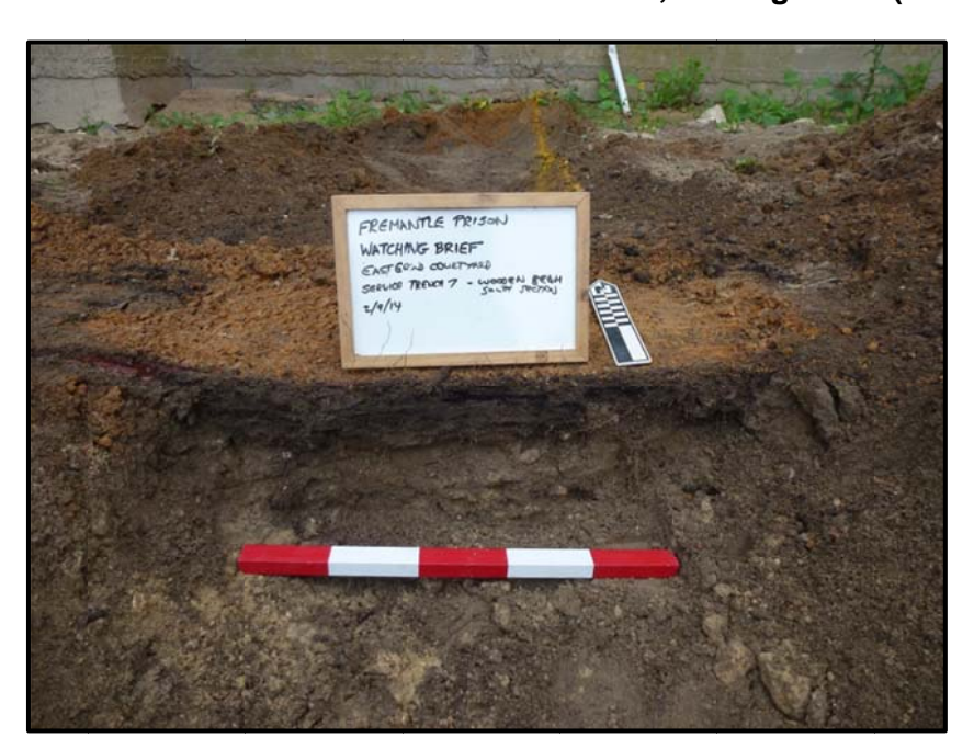
Plate 12: View of wooden feature C.77 in Trench ST7, looking north (Scale = 50 cm)

The wooden feature (C.77) recorded in Trench ST7 would appear to represent a retaining feature acting as a boundary between layer C.45 and the clay surface C.57, similar to the wooden feature (C.65) recorded in Trench ST5.